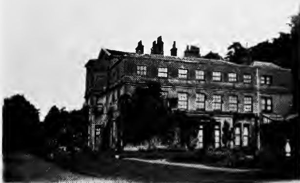
MOOR PARK HOUSE, SURREY